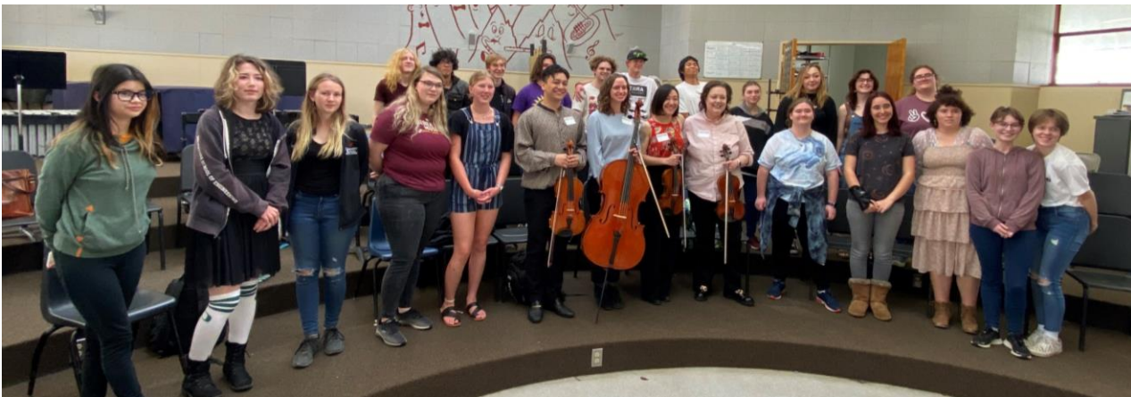
A happy group of Sierra High music students after The Tower Quartet visit to their classroom

Back by popular demand, The Tower Quartet visited the music department at Sierra High to share musical performances, advice, insights, and answers to free-ranging questions from the students. The musicians played pieces in the theme of "musical mimicry", and there was great discussion on how the music evoked thoughts and visions of other things...including chickens! (yes, intentionally) The students were engaged and observant as they watched and listened to the pieces. One of the big challenges was identifying the timing of the piece, with one student coming up with the right (very tricky) answer. The visit was the final student outreach for this school year. FOAL tries to schedule 4-5 per year.