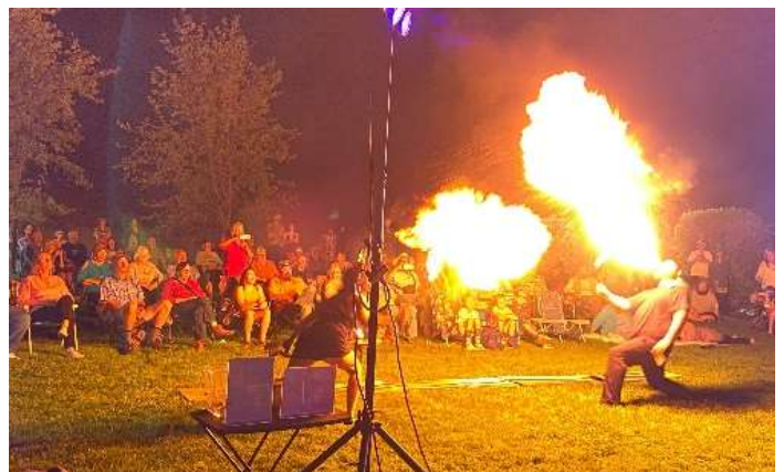
Part of the fiery finale at the benefit concert

Please take a look at the sponsors list on p.4 and if you get the chance, thank them and support their businesses!